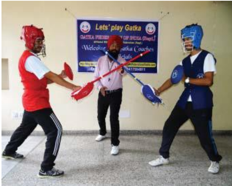
FIGURE-13 ONE POINT